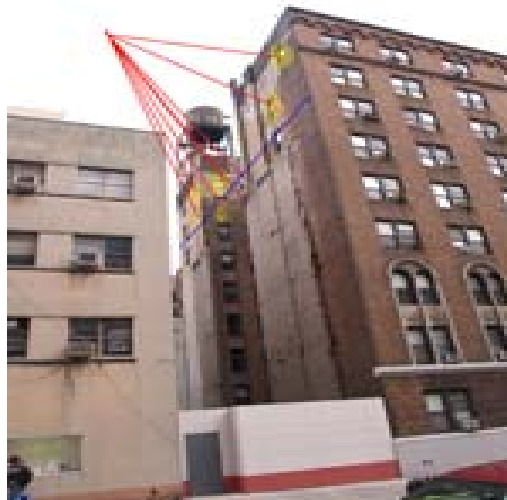
Figure 3 East Facade 18 West - Blocked Windows

The above drawings do not show an accurate or meaningful portrayal of the East Face as can be seen partially in the photo in Figure 3 below: