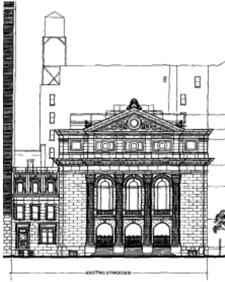
Figure 1 CPW Elevation Drawing AOR-15 As of Right